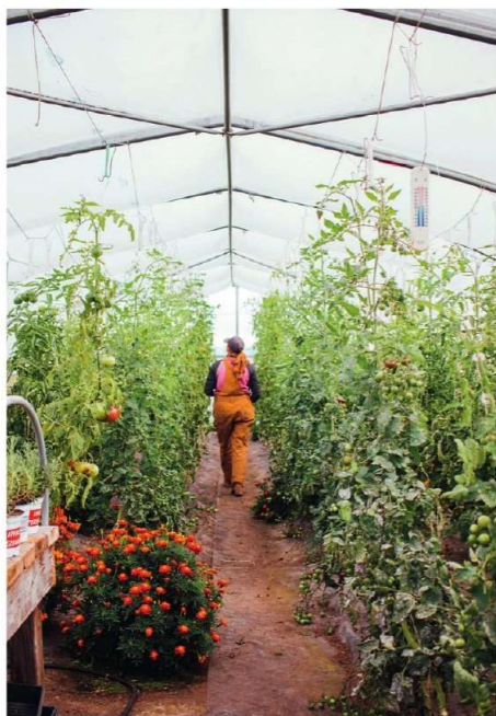
Le Germain Charlevoix