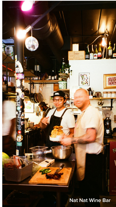
Nat Nat Wine Bar