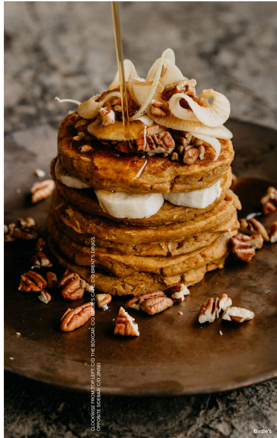
CLOCKWISE FROM TOP LEFT: C/O THE BOXCAR; C/O BIRDIE'S CAFÉ; C/O BRENT'S DRUGS. OPPOSITE SIDEBAR: C/O JINSEI

Step into the past at this former soda fountain/pharmacy. Eighty years later, Brent's still answers the call for uncomplicated American fare. Grab a booth or barstool and settle in for a nostalgic dining experience. The cherry Cokes and egg and olive sandwiches are early originals, but it's all satisfying comfort food. brentsdrugs.com