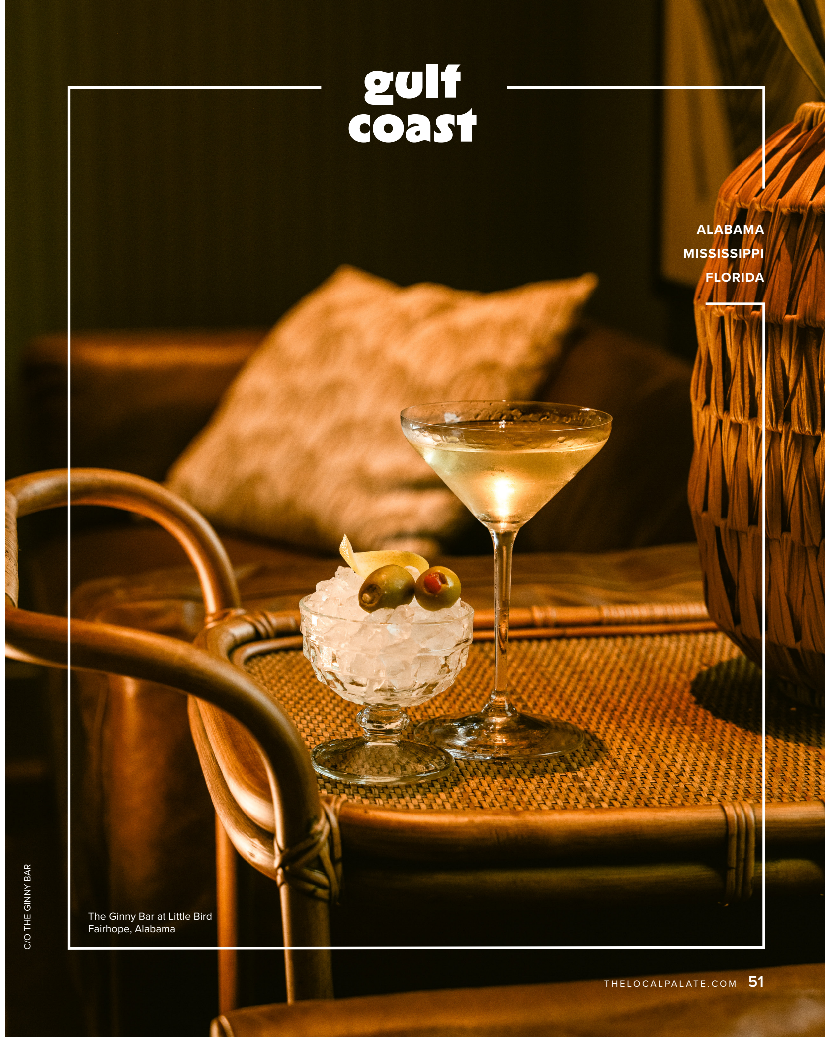
C/O THE GINNY BAR