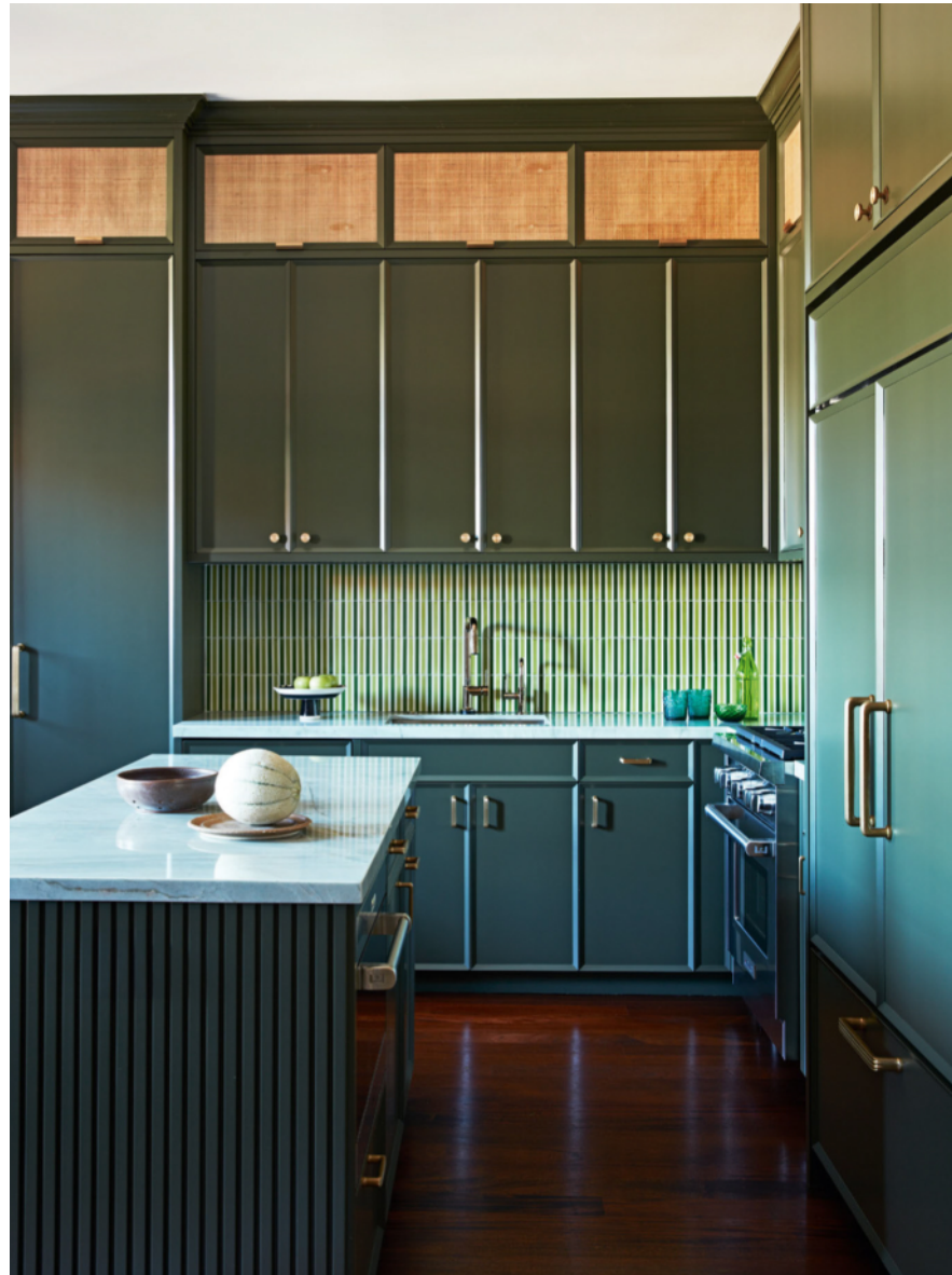
KITCHEN Rattan insets across the uppermost cabinets lighten the look of ceiling-high storage. Splashback tiles, Alchemy Materials. Brass hardware, E.R. Butler & Co

“The apartment is a very intimate, cosy place that is very sensual, atmospheric and moody”