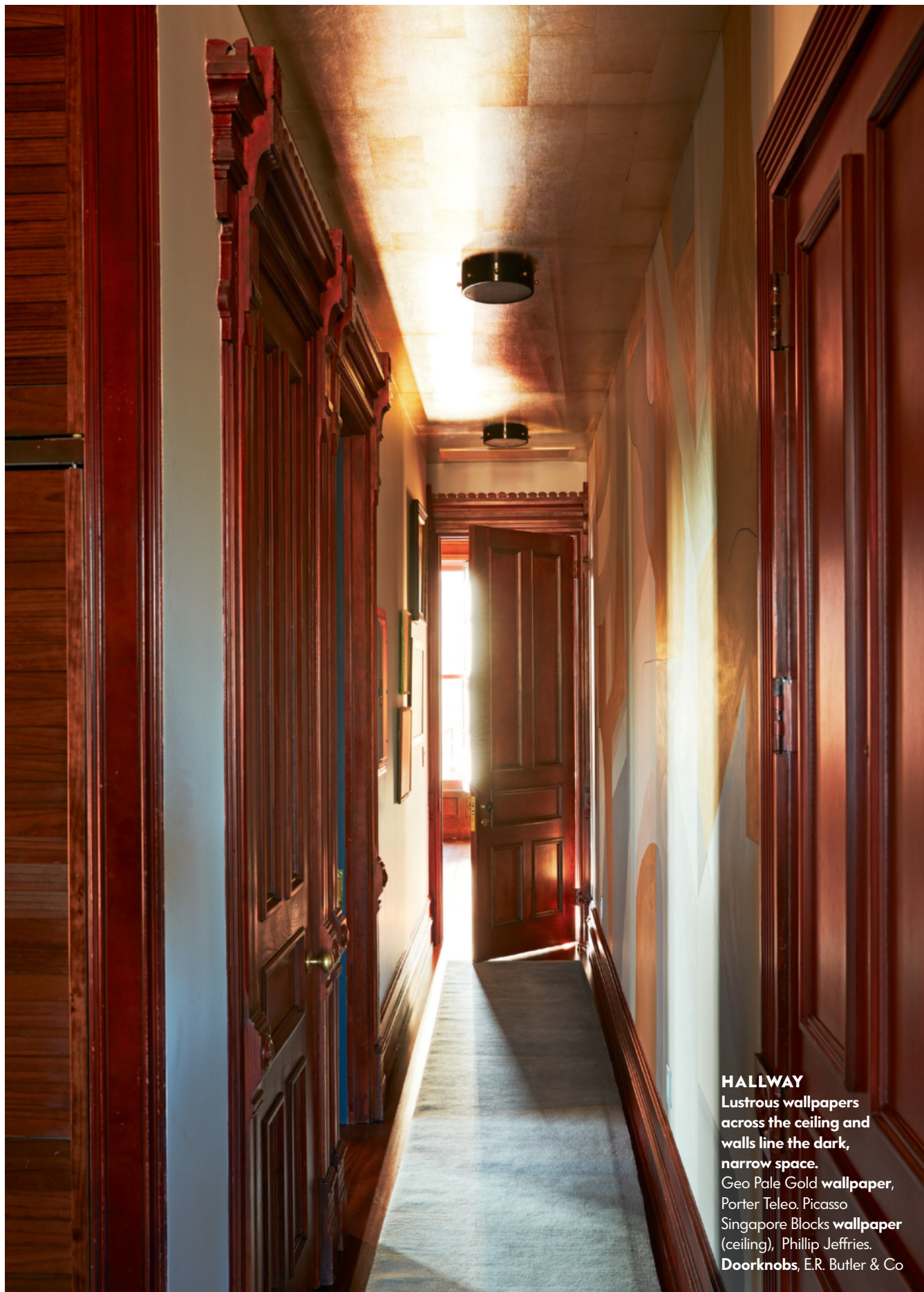
HALLWAY Lustrous wallpapers across the ceiling and walls line the dark, narrow space. Geo Pale Gold wallpaper, Porter Teleo. Picasso Singapore Blocks wallpaper (ceiling), Phillip Jeffries. Doorknobs, E.R. Butler & Co