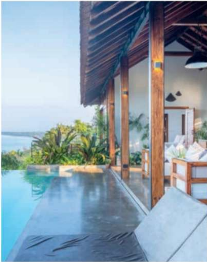
One of 4 villas with private pools.

afternoons are whiled away soaking in the private pools, and evenings descend in the hushed glow of coastal twilight. Encounters with other guests are rare, reinforcing the sense of a wholly exclusive escape suspended between hillside forest and open sea.