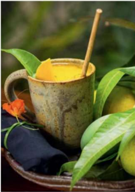
Fresh fruit drink.