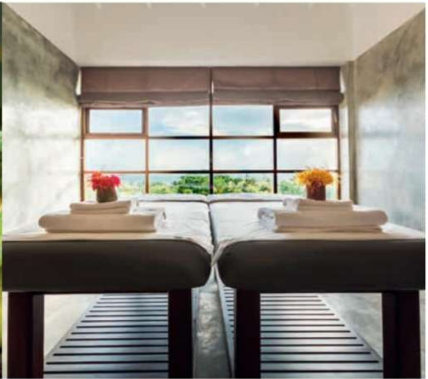
The spa at Coco Shambhala Sindhurg.