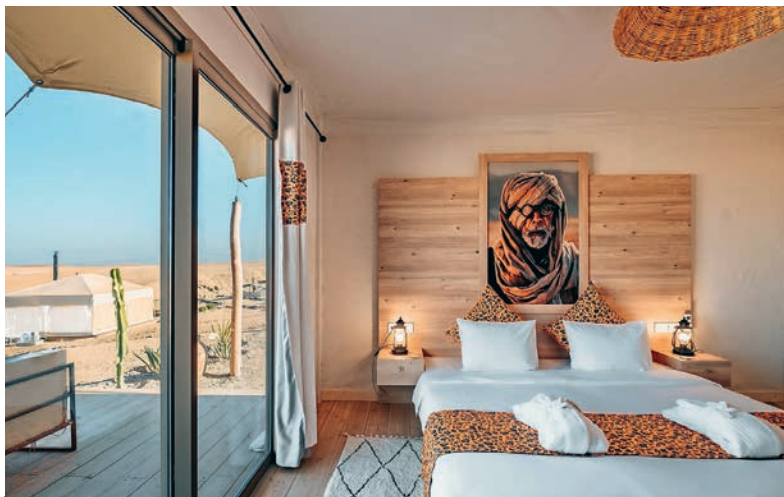
Left and below: The High Atlas massif draws adventure seekers, who find supreme comfort at Inara Camp