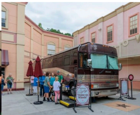
Clockwise from left: Dolly at the Country Music Hall of Fame exhibition; the Home on Wheels tour bus; Pigeon Forge, Tennessee. Opposite, from top: Dolly's childhood home has been recreated; her statue outside the Sevierville courthouse.