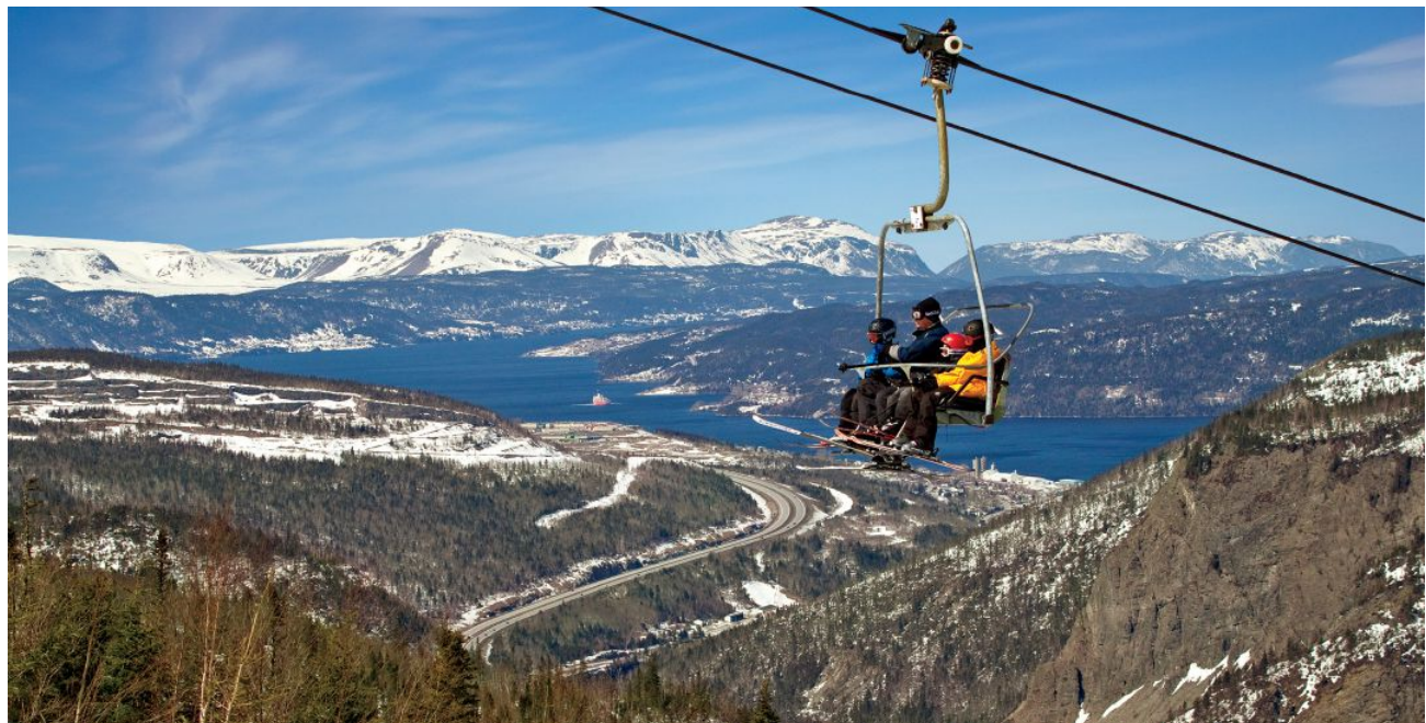
NEWFOUNDLAND AND LABRADOR TOURISM