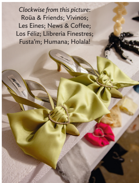
Clockwise from this picture: Roüa & Friends; Vivinos; Les Eines; News & Coffee; Los Feliz; Llibreria Finestres; Fusta'm; Humana; Holala!