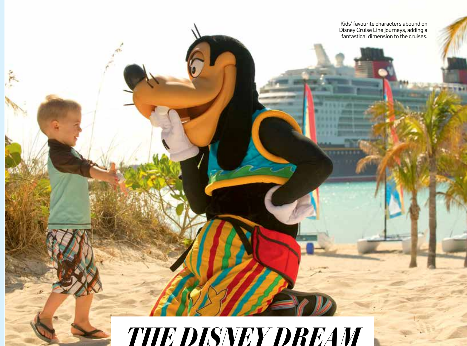
Kids' favourite characters abound on Disney Cruise Line journeys, adding a fantastical dimension to the cruises.