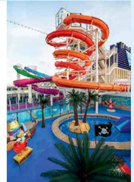
From top: The aquapark on the cruise takes fun to another level; Ocean Place is the go-to hangout zone on the Norwegian Getaway.

Did I say, a bar? The Norwegian Getaway has over a dozen bars and lounges, not to forget the alcohol served in most of the eateries and theatres. From specialists like the Sugarcane Mojito Bar and the Chill Bar popular for its margaritas, to we-serve-anything-alcoholish dining and drinking spaces, the management keeps everyone in a perpetually happy state.