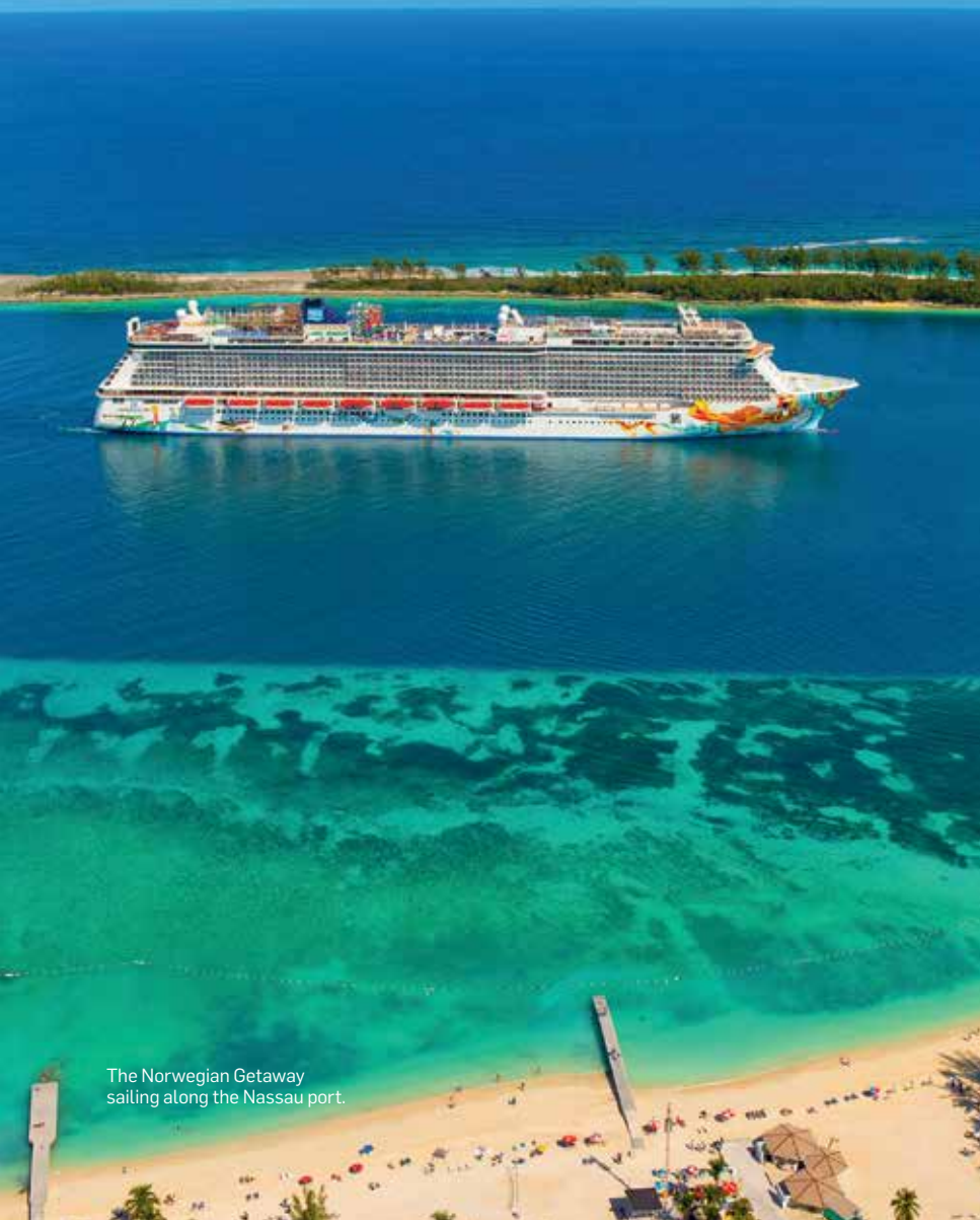
The Norwegian Getaway sailing along the Nassau port.