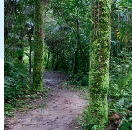
Clockwise from left: The Sugarcane Bar is one of many bars on the Norwegian Getaway; a trek through the Belize Jungle leads you to the mysterious Caves Branch stream; head to Wasabi for a hearty Japanese lunch.

I grid my loins and try out most of the bars (all in the name of duty!), but my freeze-frame moment comes at the Skyy Vodka Ice Bar. Inspired by the ice hotels of Scandinavia, everything inside is made from ice—the bar counter, seats, and glasses included. I am made to suit up, as if for a polar expedition, before stepping inside, where I promptly become one with the ice. No surprises, since this enclosure is constantly maintained at a chilly -8° Celsius. The bartender attempts to thaw me with his special cocktails created with Skyy vodka, but all the vodka in Russia cannot bring my fingers and toes back to life.