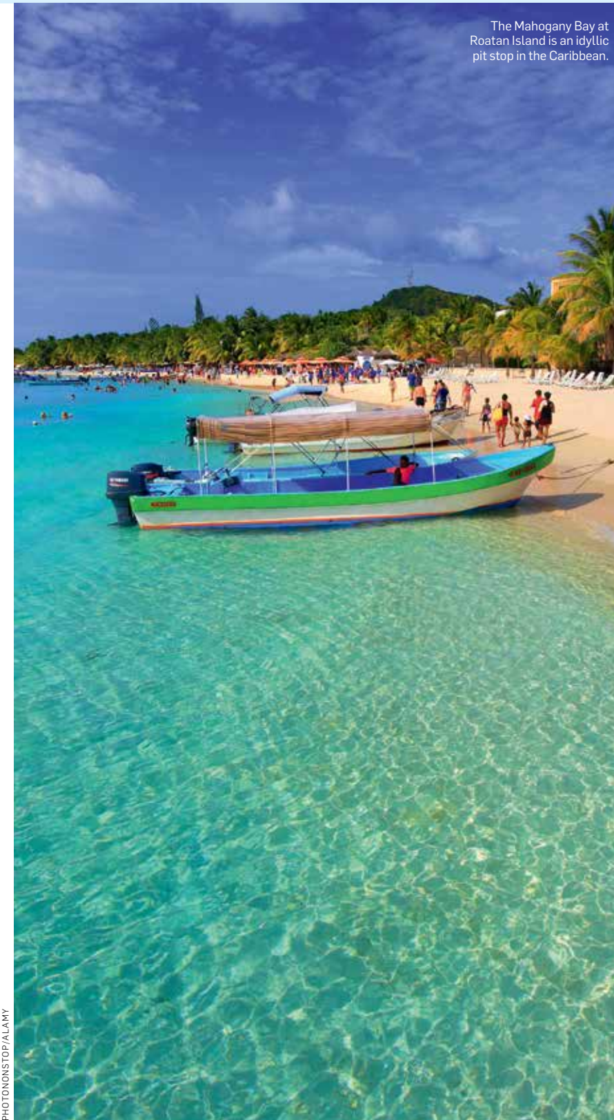
The Mahogany Bay at Roatan Island is an idyllic pit stop in the Caribbean.