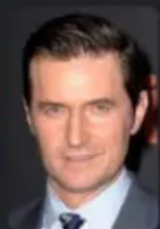
Richard Armitage Trevor Belmont