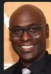
Lance Reddick The Captain