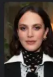
Jessica Brown Findlay Lenore