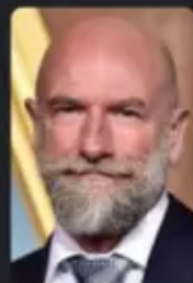
Graham McTavish Dracula