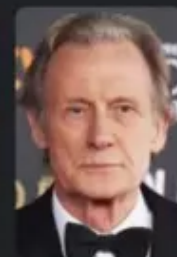
Bill Nighy Saint Germain