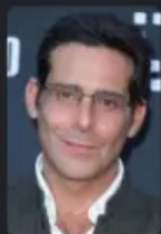
James Callis Alucard