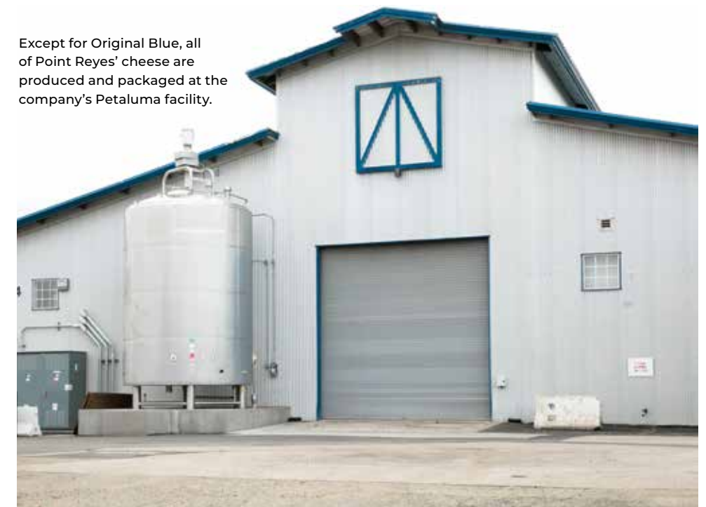
Except for Original Blue, all of Point Reyes' cheese are produced and packaged at the company's Petaluma facility.