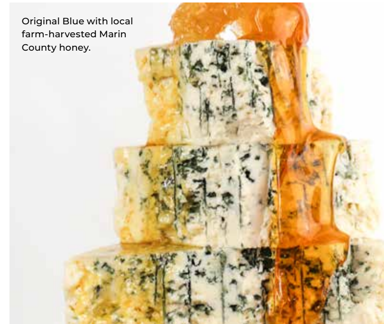
Original Blue with local farm-harvested Marin County honey.

Each batch of Quinta turns out 450 4-inch wheels. Once the cheeses are on racks, they are flipped, covered with candida yeast, and then wrapped in softened spruce bark that’s been soaked in a tea made from locally sourced Bay Laurel leaves. The cheeses are closely monitored for 30 days, growing just the right amount of exterior mold in the temperature-controlled room. Before they are packaged and released, each wheel is embellished with a Bay Laurel