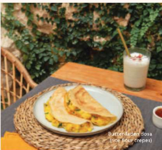
Butter-laden dosa (rice flour crepes)

You'll see snaking queues on a Sunday morning, even as early as 7am – a definite indicator that this is, indeed, one of the best breakfasts in town. mavallitiffinrooms.com