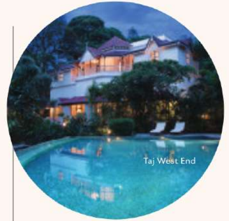
Taj West End