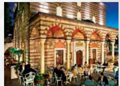
Enjoy a cup of coffee after your treatment

would prevent a headache as we were headed to the Cold Room