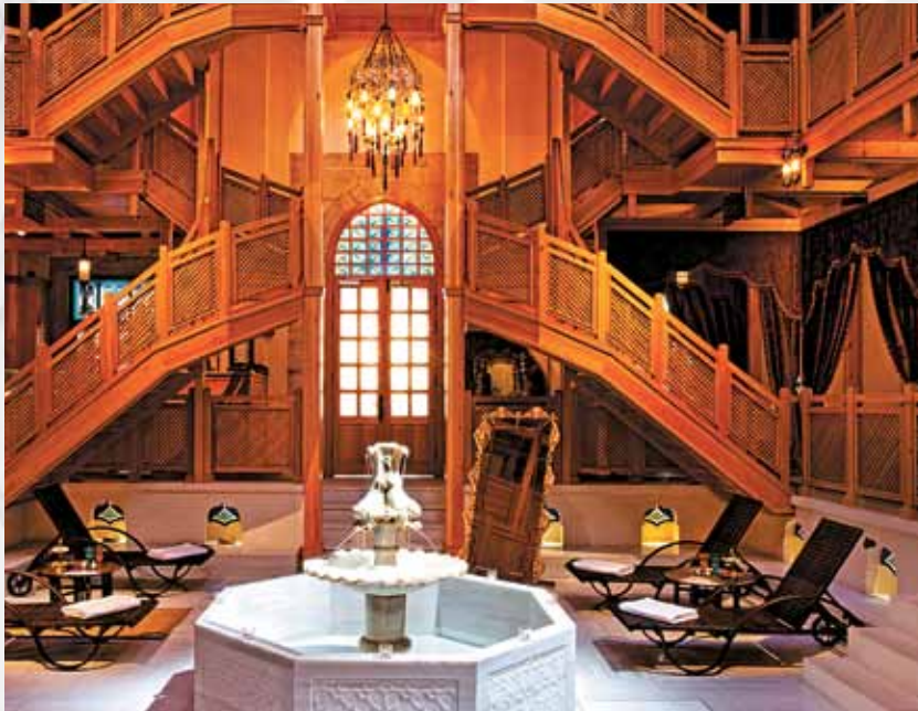
The Cold Room is the place to relax

include the Pir-i Pak (traditional full cleanse), Keyf-i Hamam (pleasures of the hammam), Zevk-i Sefa (extravagant pleasures) and Ab-i Hayat (elixir of life).