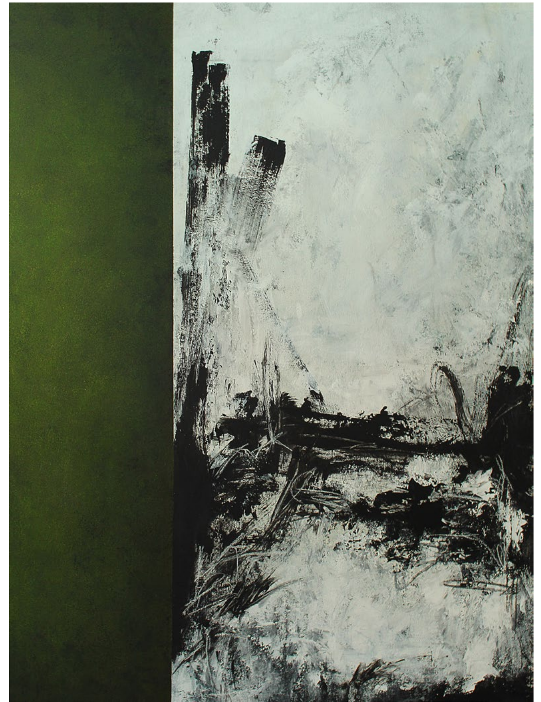
Emotional Juxtaposition of Time & Space - Green (2020) , Acrylic on canvas