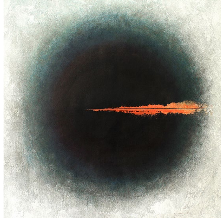
Piercing Solitude (2019), Acrylic on canvas