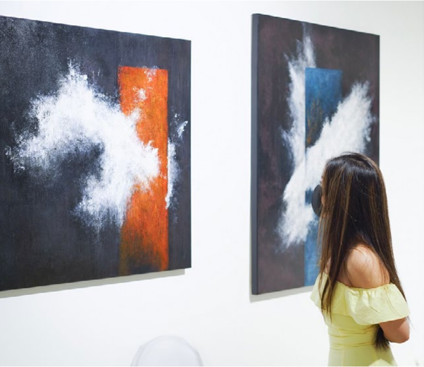
ZHAN Art Space Gallery