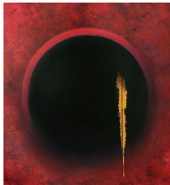
Piercing Solitude (2019), Acrylic on canvas

“Our actions - or inaction - during these trying times affect the community as a whole.”