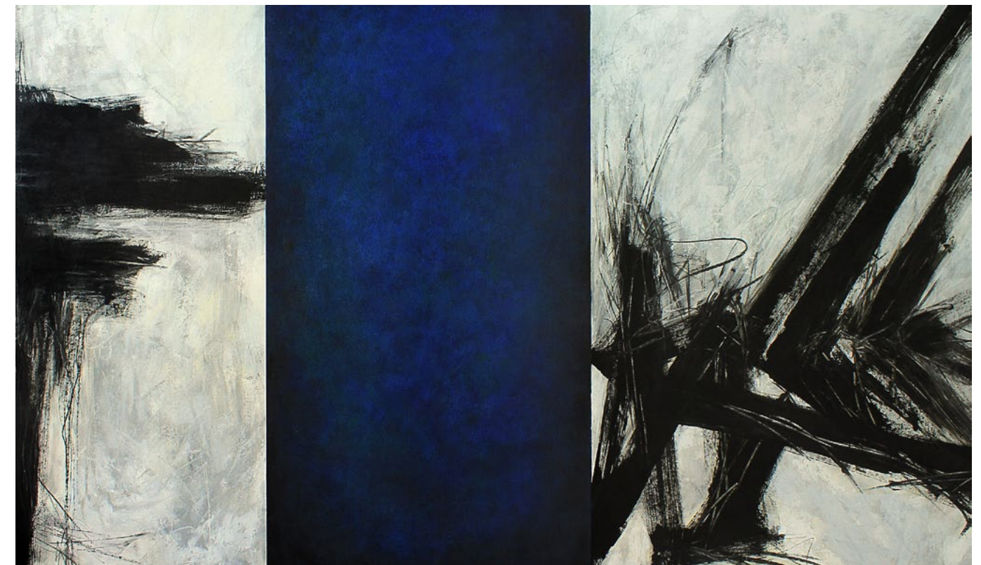
Emotional Juxtaposition of Time & Space - Blue (2020), Acrylic on canvas.

The art director turned painter is opening her first solo exhibition in Malaysia at ZHAN Art | Space, The School, Jaya One. Curating art works by more than 50 artists since its inception, ZHAN Art | Space is active in the role of providing a platform for both budding and well-established artists to gain exposure as well as to showcase their talents.