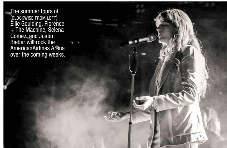
The summer tours of (CLOCKWISE FROM LEFT) Ellie Goulding, Florence + The Machine, Selena Gomez, and Justin Bieber will rock the AmericanAirlines Arena over the coming weeks.