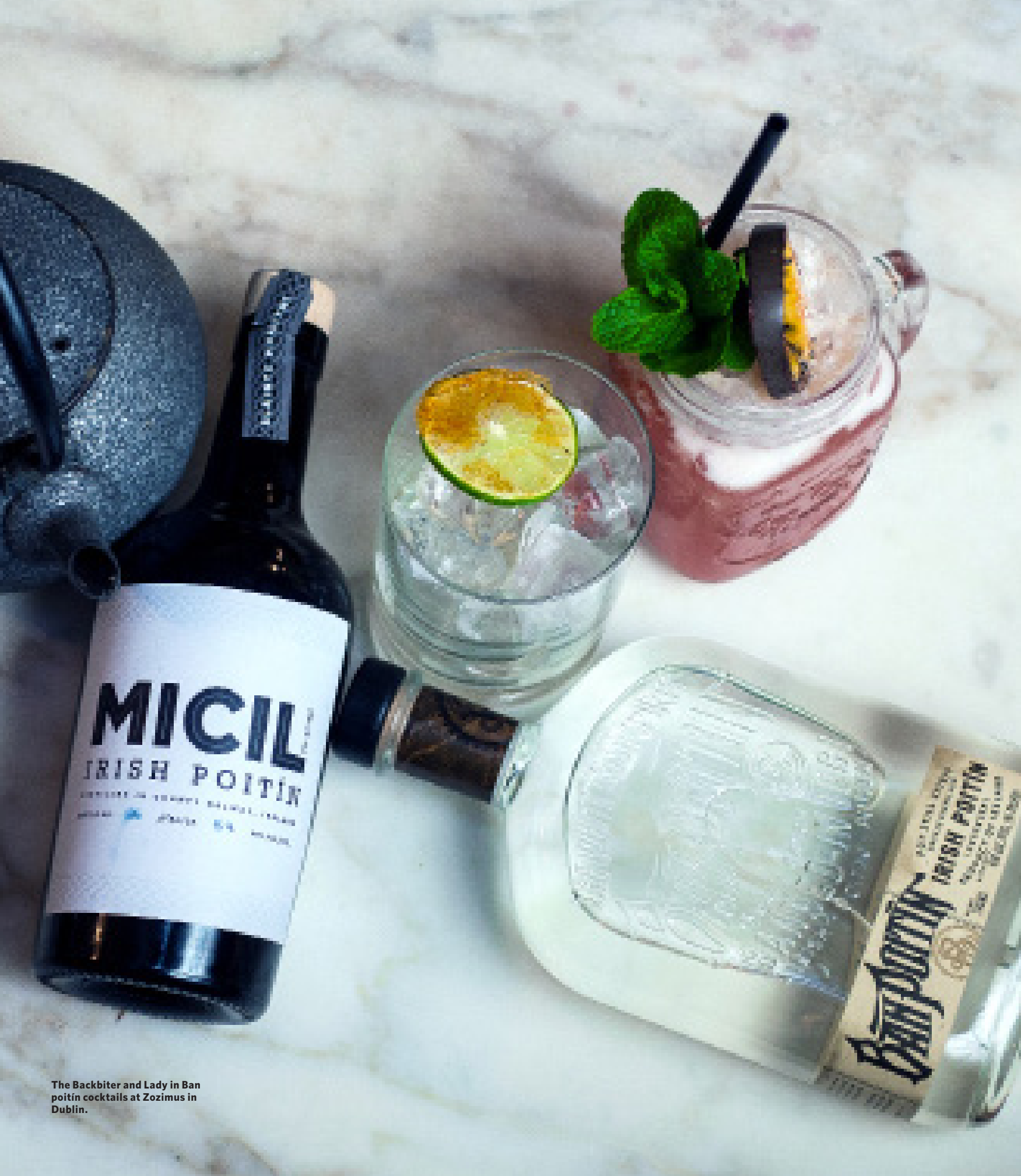
The Backbiter and Lady in Ban poitin cocktails at Zozimus in Dublin.