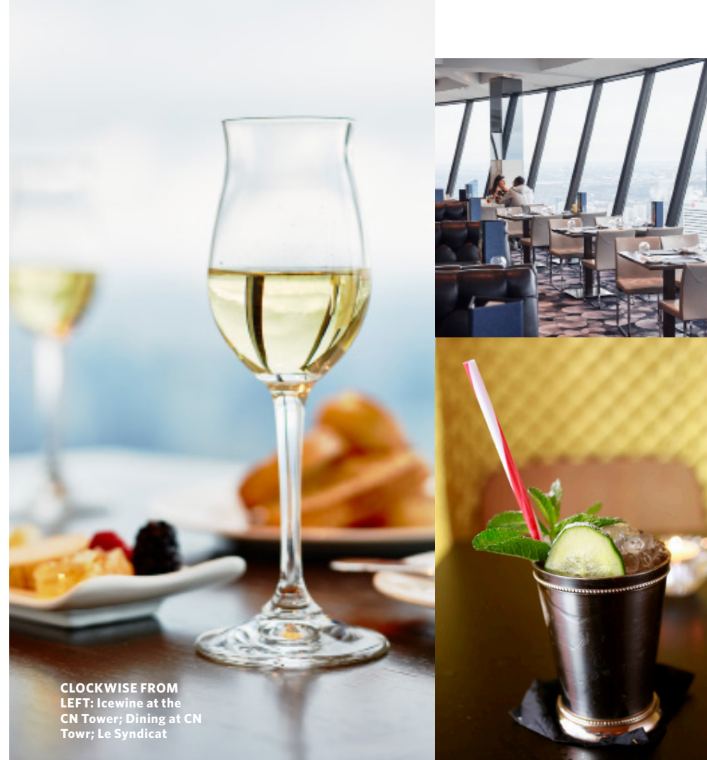
CLOCKWISE FROM LEFT: Iced wine at the CN Tower; Dining at CN Tower; Le Syndicat

HOW TO SAY "CHEERS": Santé (formal) or Cin cin (chin-chin, and less formal). WHERE TO DRINK IT: To sample an expertly made Cognac-based cocktail, go to Le Syndicat, one of Paris' best (and one of the few) craft cocktail bars that prides itself on a large selection of French spirits.