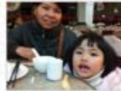
My baby girl and her nanny enj...