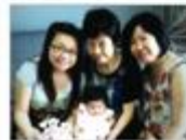
4 Generations of happiness and...