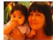
HEALTH IS WEALTH :)