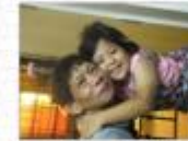
Loving, from all angles.