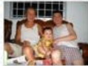
A warm smile of a loving fami...