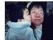
SHE IS IN MY HEART