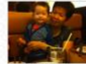
same look!!!! it is the EYES!