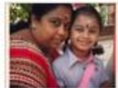
Grandmother's Pure Love.