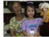
My Wonderful Grandmother and L...