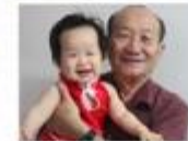
Do I look like My Lovely Grand...